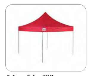
3.6m x 3.6m PRO