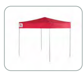
2.1m x 2.1m PRO