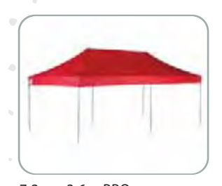
7.2m x 3.6m PRO