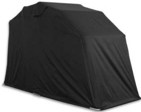
Fully Closed Bike Kubby