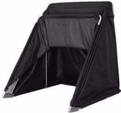
Fully Open Bike Kubby