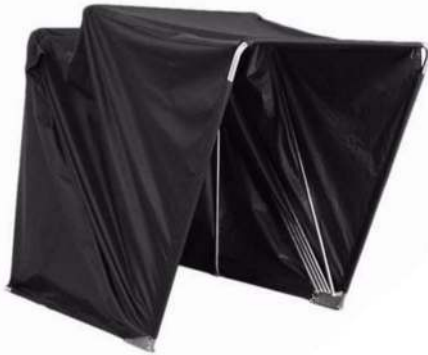
Partially Open Bike Kubby